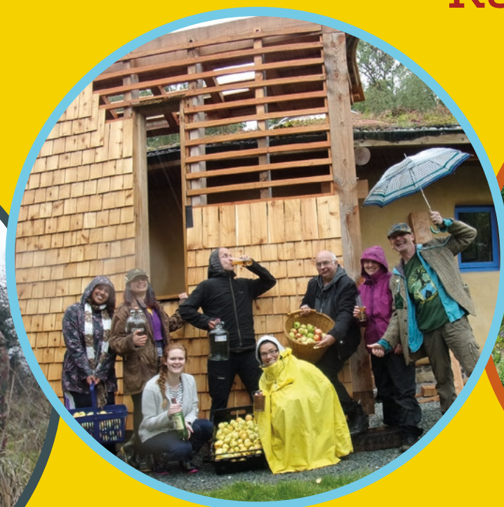
The Cider House