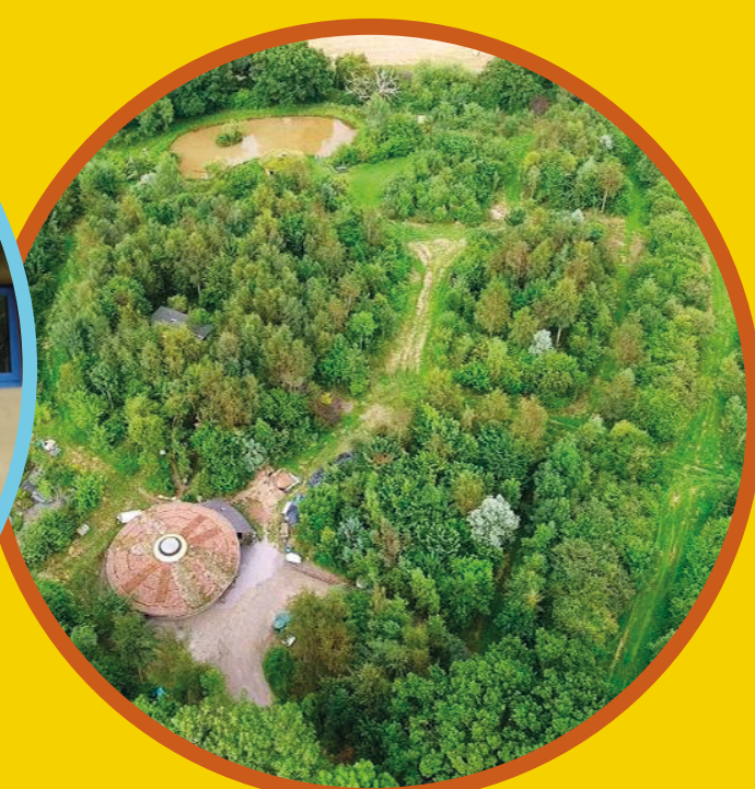
The Forest garden

"On site energy at Karuna comes from wind & the sun. We grow as much of our own organic food as possible. Keeping ourselves fed with a staple diet all year round."