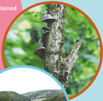
Top: fungi at Comrie Croft. Bottom: on a foraging walk

Edge can be seen as the intersection of two environments, and is where energy and materials accumulate or are transformed. Different types of mycelium exist in certain habitats and fruit under the right conditions – this fruit is fungi, or mushrooms. Fungi