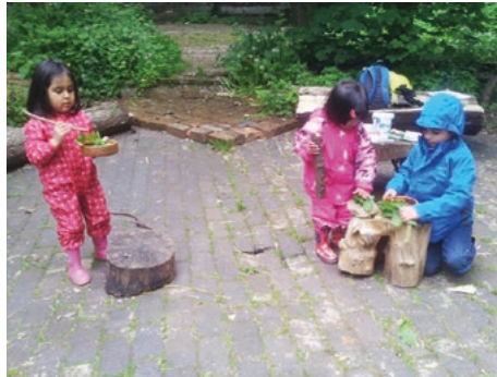
An Amazing Apothecary at Highbury Orchard, Birmingham

The Huxhams Cross Share Offer is still open with funds coming in to support this work and make it happen. Be part of funding this innovative, locally-connected, health-giving farm project – let's make it happen: barn, access, training room, space for processing produce, wellbeing centre, sustainable electricity and heating project and more. Together we can make the change.