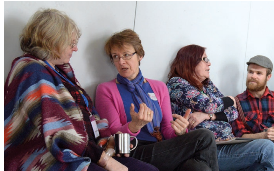
Research Diploma Enterprise discussion

It has been another really busy quarter for the Research team. We are slowly getting used to the big shift that happened in our work around the time of the conference last year. Our focus is more and more on international work, serving a global permaculture community of maybe 3 million! In many ways we are now the world’s leading permaculture research coordinating organisation.