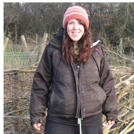
Eyebright Ecology in Staffordshire

You can see a directory of all group and business members at www.permaculture.org.uk/directory . This directory is evolving. By listing online we save paper and space in this newsletter, and money in print costs and staff admin time.