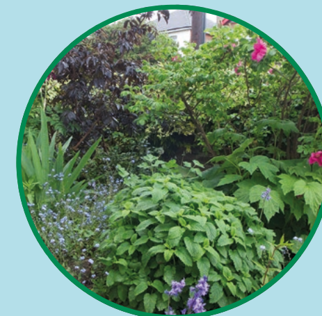
The main planting bed in full bloom

The house and garden are open during Transition Town Worthing's Eco Open Houses weekend 24-25 September, which is focusing on rainwater capture and combating flood risk.