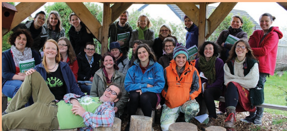
Group on the outdoor classrooms course in May