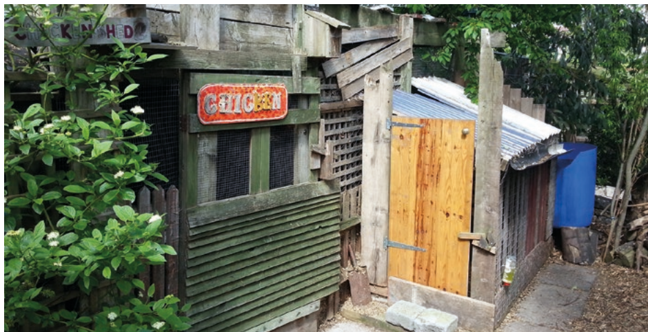
Bensham Manor School in Thornton Heath is home to a very special permaculture garden.