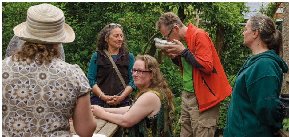
Permaculture Scotland Gathering participants in a sourdough bread making workshop