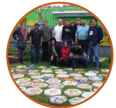
Volunteers at Scotswood Natural Community Garden

"We're excited about 18.5 acres of land in East Sussex. And we're excited about it because its our second tranche of land as we work to get new entrants into ecological farming. We think you should be too as although what we do sounds simple, the work and challenges are huge and the implications are broad."