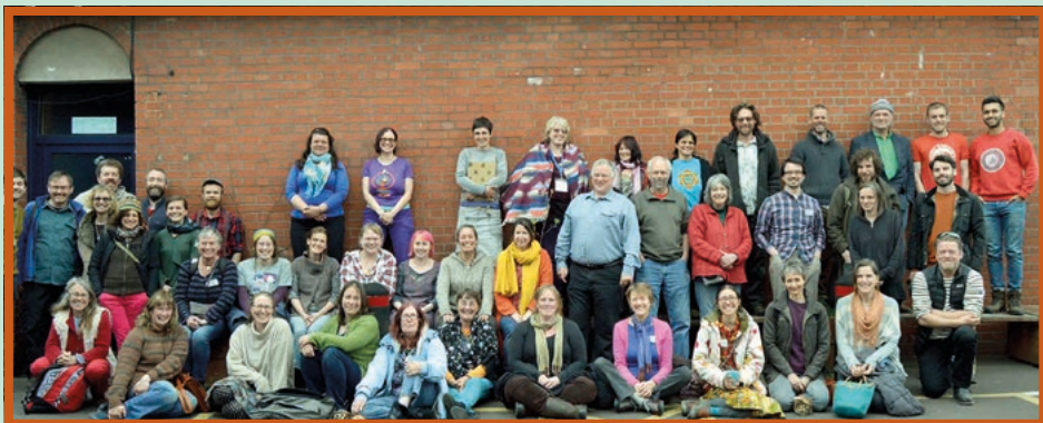
Diploma Gathering group 2016