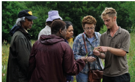
Top: OrganicLea student group separating garlic cloves for planting Bottom: OrganicLea teaching salad rotation