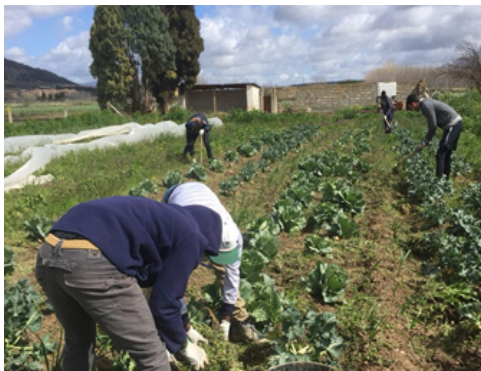
The first harvesting and selling

The La Bolina core team met in an Eroles Project residency in Spain where 16 people from all over the world (including international development workers, artists, lawyers, migrants, permaculturists, farmers, activists, and academics) gathered to bring their knowledge together to create an integrated, holistic approach to borders, climate change, new economy, human rights and migration. A shared vision and set of values emerged, along with a deep understanding of each other and a commitment to radical friendship. This resulted in the group deciding to live, work and develop La Bolina together. After a year of site visits to depopulating villages in Granada province in a search for the project's long-term base, the municipality of El Valle fitted the project's criteria (proximity to a city, local services, school, public transport, severe depopulation, empty building & available land), with a welcoming response from the local council and local people. The team moved to El Valle in late 2017, and have focused on understanding and becoming fully engaged with what is happening at the local and regional level in the fields of regeneration, sustainability, social economy and migrant integration and is adapting the project's model in response.