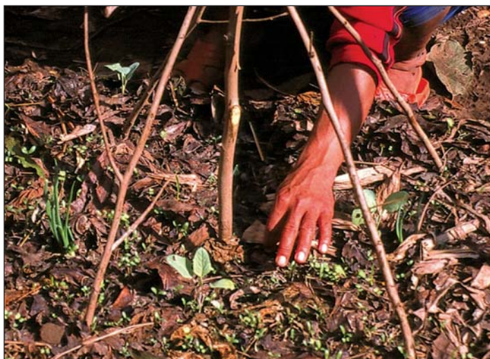
A mulch of leaves is applied on top of the broadcast seeds, between the planted seedlings

Once everything is planted, sprinkle ash, rock dust or sea weed powder on top as fertiliser. Cover with enough topsoil or compost to cover all seeds and fertiliser. Then add a thin cover of mulch, taking care not to cover the seedlings. The mulch prevents both the drying out of the soil and compaction in heavy rainfall.