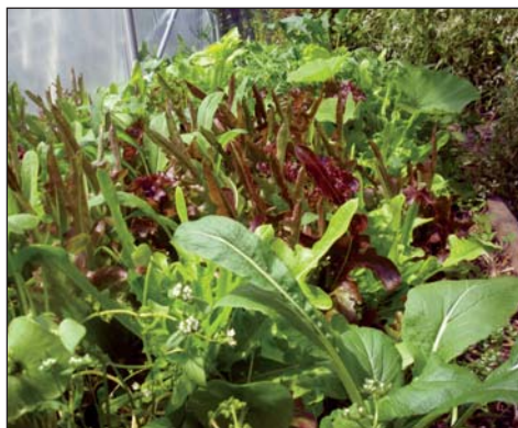
Lettuces and other greens ready for thinning

Six weeks after sowing, production is increasing and there is no bare soil. Broad leaf mustard, coriander and lettuce can be harvested, along with the first radishes. The faster growing leaf crops can be picked to make space for the slower, longer living ones.