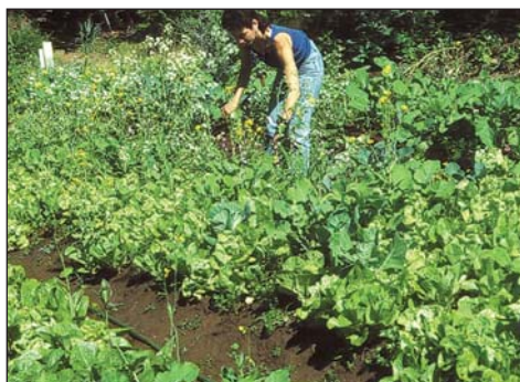
4 months: The initial groundcover has gone and longer lasting crops have closed the canopy

The maintenance of the mixed vegetable bed can be compared to that of a woodland or a forest garden. Always thin the ground cover and early crops when the later crops need more space, and always try to maintain a “canopy” of leaves to give no chance to the weeds.