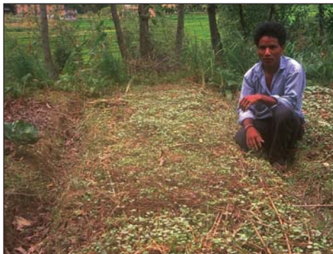
Day 7: A first flush of growth is starting to cover the ground

One week after sowing , mustard, radish, fenugreek and onion bulbs have started to germinate. The pre-grown seedlings have also established themselves.