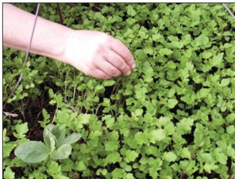
Day 21: All the ground is now covered.

After 3 weeks all vegetables have germinated. A dense cover will have spread over the ground and you can start picking leaves for salad.