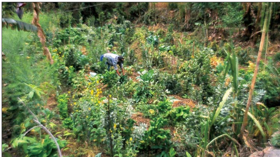
Gaps in groundcover can be filled with mulch, in this case with straw

The mixed vegetable plot should be easy to maintain. The dense planting and the layer of mulch help conserve moisture and keep down weeds, so the need for watering and weeding is minimised.