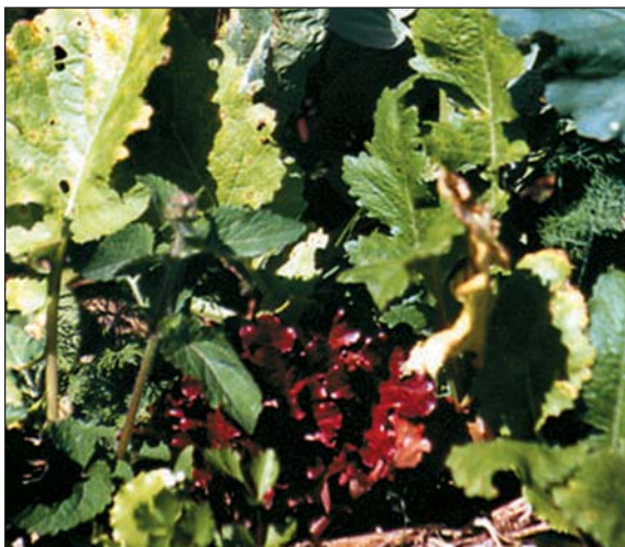
A feast in the making!