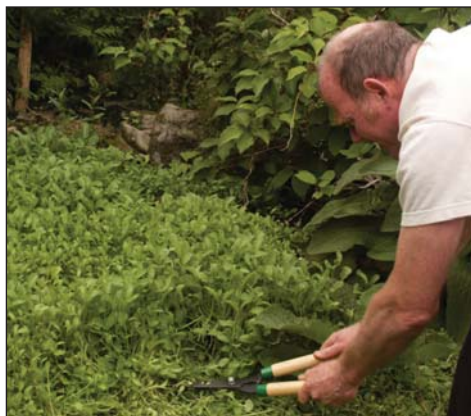
If you have achieved a very dense ground cover you can be quite drastic with your thinning, even using garden shears!

All the ground cover plants (mustard, fenugreek, buckwheat) are good salad crops. They can all be picked over the space of 2-3 weeks, except for a few plants to save your own seed from.