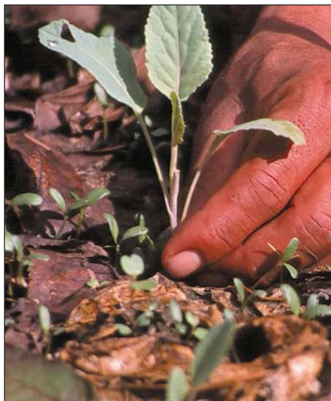
Planting the seedlings

Prepare the soil as you would for a normal vegetable patch. The more fertile the soil is, the less preparation is needed. Dig the area over, unless you are working with no-dig beds of course! Add compost (ideally in late autumn), then till the soil with a rake in spring. On a very acidic soil you can add some lime as well. It's beneficial to the soil to avoid treading on it. If the width of the beds is less than 1.5m the centre can be reached without treading on the soil.